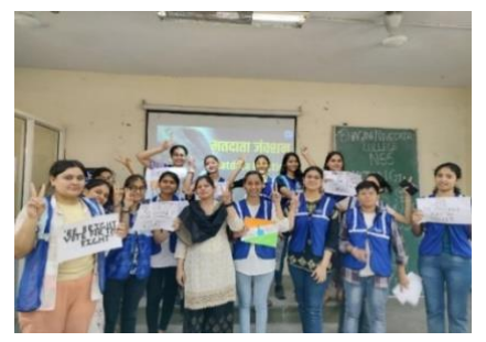
ID, (For example Form no. 6, 7 and 8). NSS volunteers expressed their thoughts on voting rights and encouraged other students to understand the value of their vote. The event remained successful and a good number of students participated in it.

Magic Show, DU : University of Delhi organized a Magic Show on 3<sup>rd</sup> May 2023 at Mutipurpose Hall, Sport Complex, NSS nominated volunteers attented this programme.